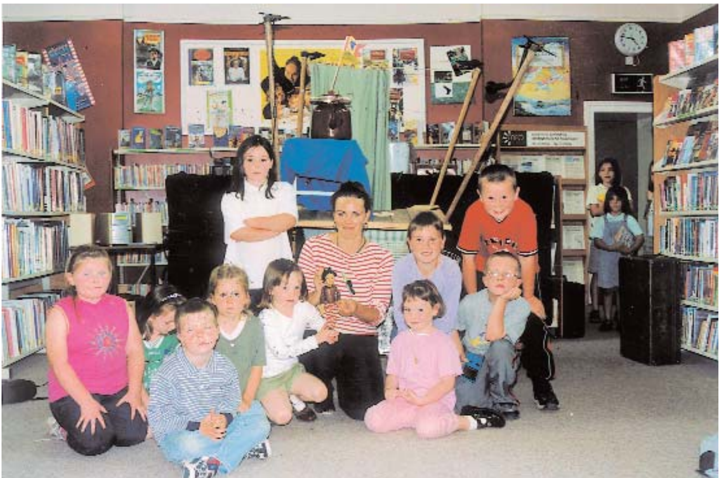
Urlingford Branch Library

Callan and Thomastown Branches were extensively renovated during the year.