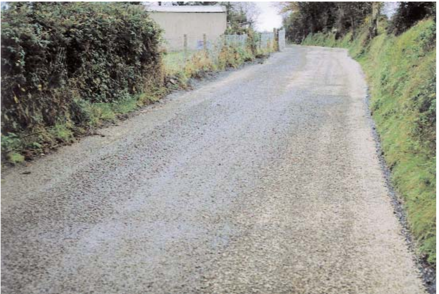
Road at Ballynooney, Mullinavat before and after being repaired under the Community Involvement in Road Works Scheme 2001.