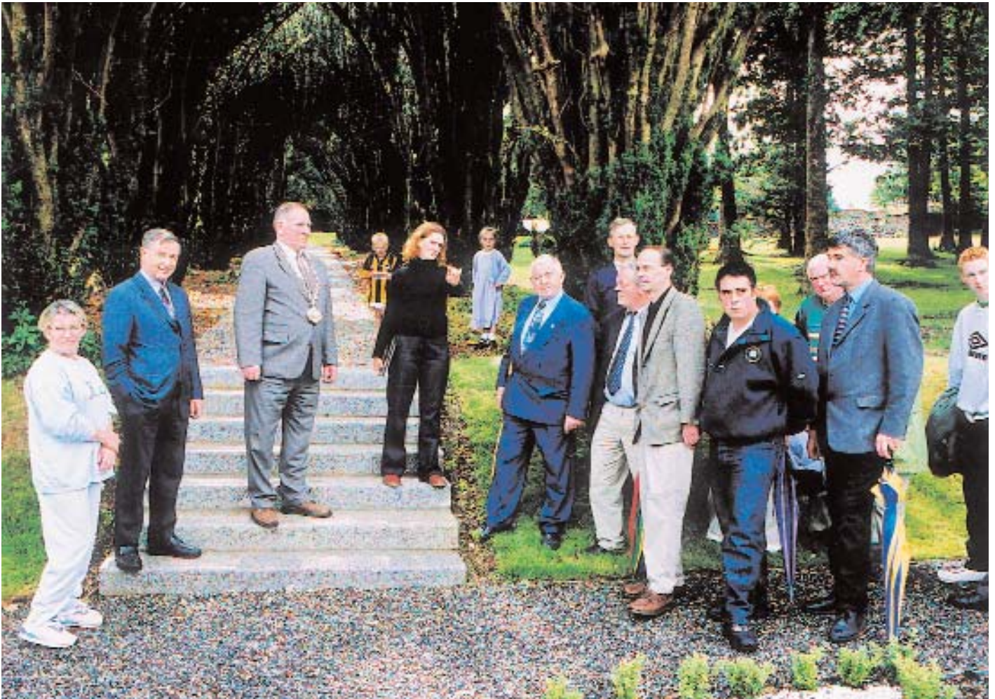
Woodstock Gardens Restoration – Visit by Councillors in July, 2001.