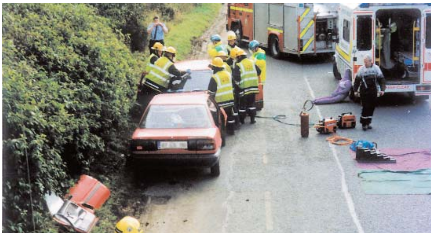
Road Traffic Accident Exercise