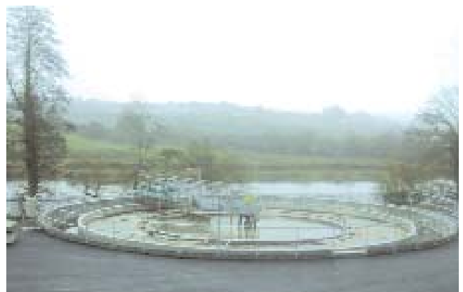
Graiguenamanagh Wastewater Treatment Plant

Exploratory well drilling has been completed and a final Report from the Consultants on the feasibility of the Scheme is awaited.