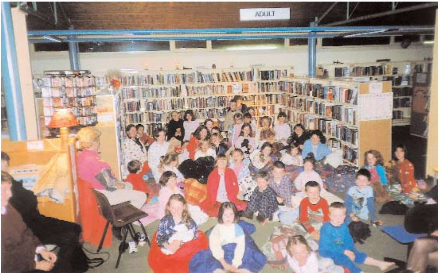
Graiguenamanagh Branch Library

Kilkenny County Library continued with its active policy of acquiring items of local interest with the acquisition of the 'Correspondence of James Butler, 1st and 2nd Dukes of Ormonde'. The trend towards 'e-queries' continued with e-mail queries now far in excess of postal and phone queries. With this trend in mind, the Library has now a website at 'kilkennylibrary.ie', which gives extensive listings of our local holdings.