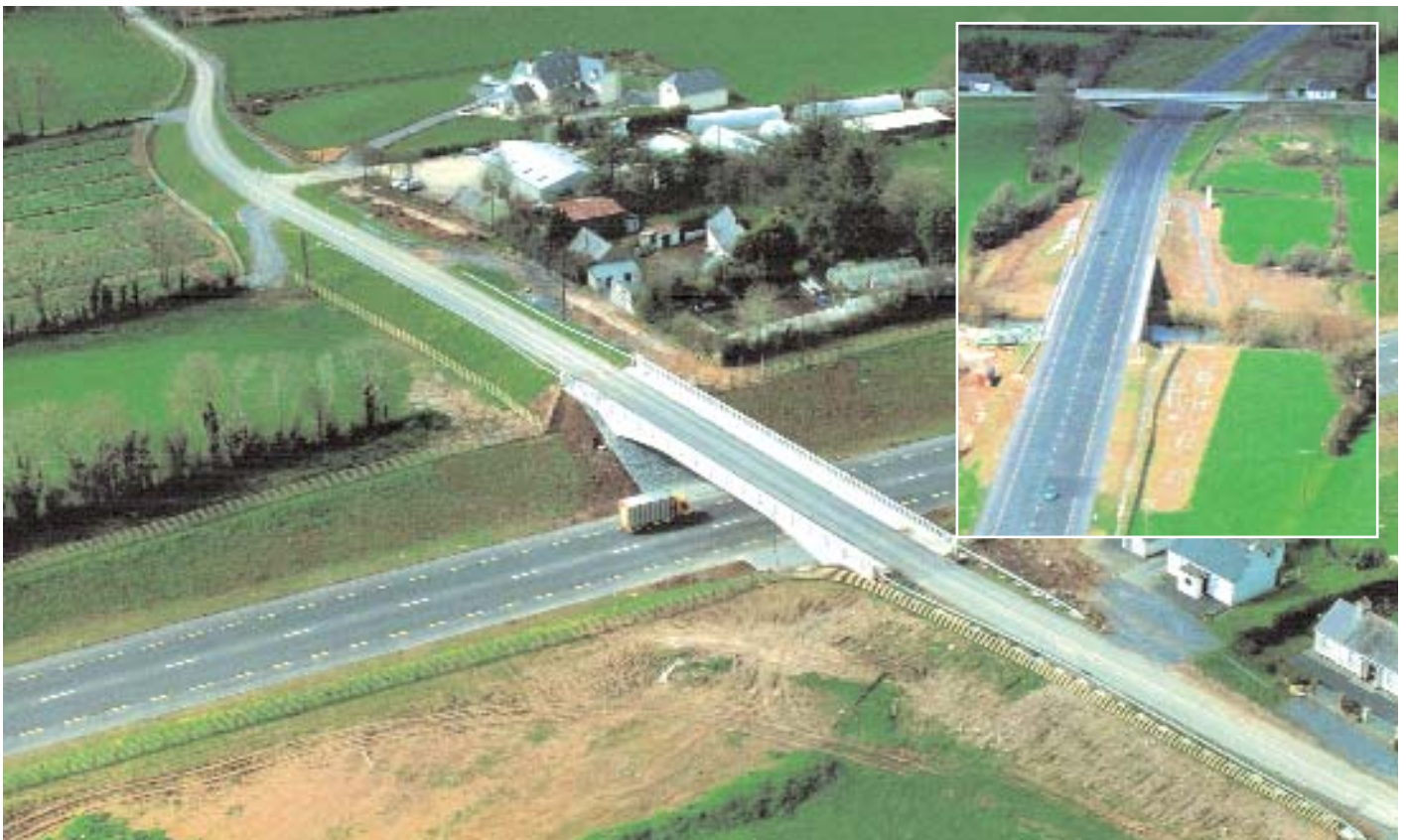
N24 Piltown/Fiddown By-Pass – Section of the new road showing the Tibberaghny Road Bridge