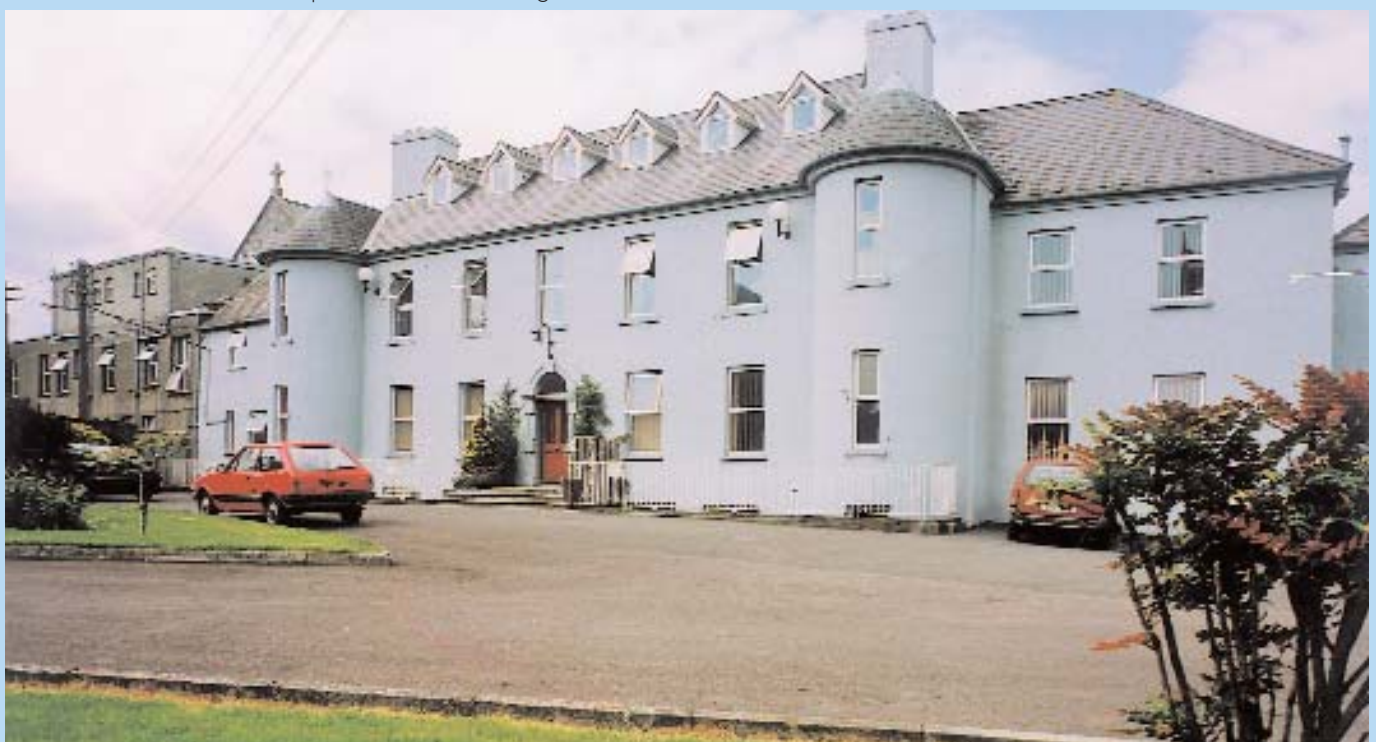
Good Shepherd Centre, Kilkenny – Accommodation for Homeless Men.