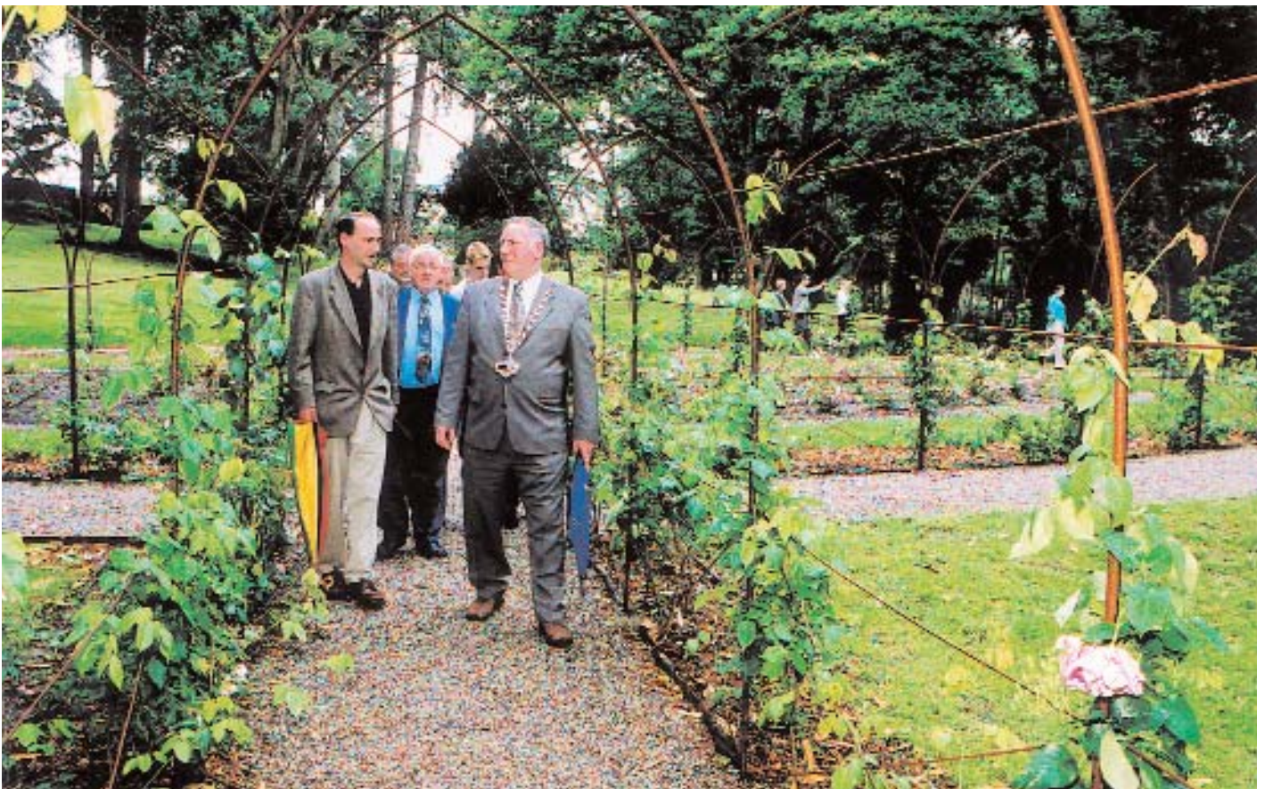
Woodstock Gardens Restoration – Visit by Councillors in July, 2001.