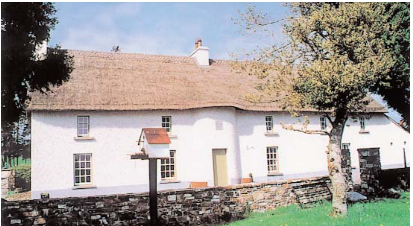
Lory Meagher Homestead • Kilkenny County G.A.A. Museum • Grace Cultural Centre, Craft Shop and Restaurant, Tullaroan, Co. Kilkenny.