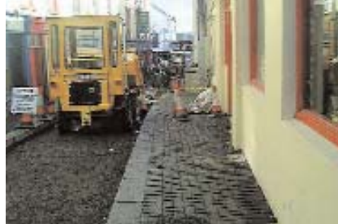
Old School Yard – Patrick Street